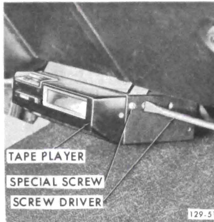
Figure 129-22 Anti-Theft Screw Removal