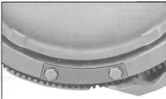
Figure 2-43—Installation of Balance Weight

6. At the point where the balance weight produced the greatest improvement in vibration install weights of proper thickness to eliminate objectionable vibration. Balance weights are available in several different thicknesses.