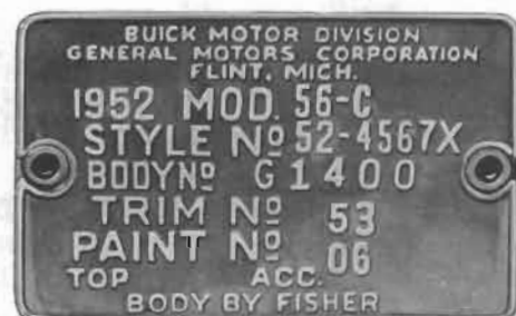
Figure 13-1—Fisher Body Number Plate

Buick Service Department. All issues of the Service News should be kept on file for ready reference.