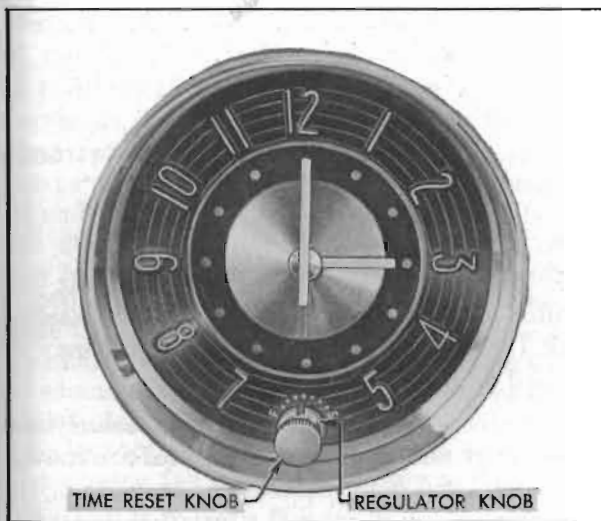
Figure 10-105—Clock Time Rest and Regulator Knobs

The electric clock, either Borg or New Haven, is mounted in the instrument panel to right of the radio speaker grille. The clock wiring circuit is protected by the "clock" fuse on the fuse block under the cowl. The clock light is controlled by the rheostat in the lighting switch and is protected by the thermo circuit breaker.