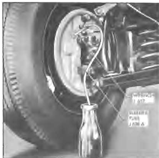
Figure 8-6—Bleeding Wheel Cylinder

6. When bleeding operation is completed at