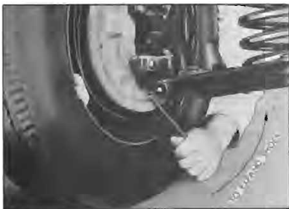
Figure 8-8—Expanding Brake Shoes

6. Remove adjusting hole covers from brake backing plates. Using suitable tool to turn brake adjusting screw, expand brake shoes at each wheel until the wheel can just be turned by hand. Moving outer end of tool upward toward center of wheel expands the shoes. See figure 8-8. The drag should be equal at all wheels.