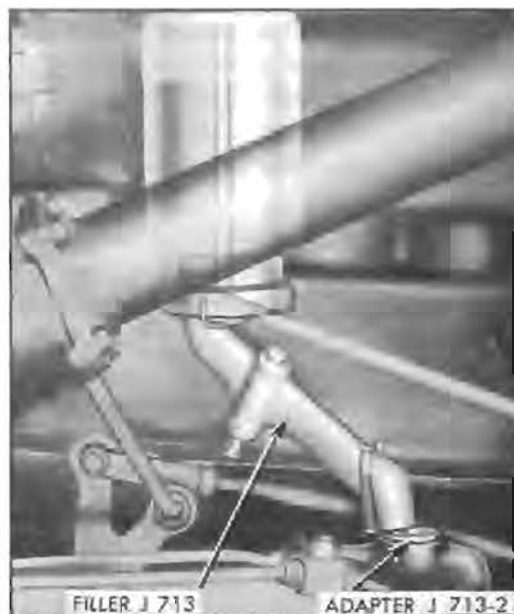
Figure 8-5—Master Cylinder Filler and Adapter

A bleeding operation is necessary to remove