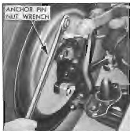
Figure 8-9—Using Anchor Pin Nut Wrench J 854

18. Install rear brake drums. Remove adjusting hole covers from all backing plates.